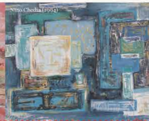
Nino Chedia (1964)