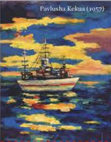
Pavlusha Kekua (1957)