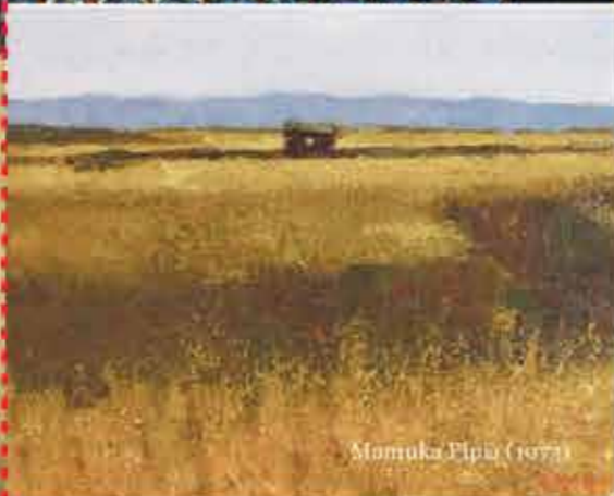
Mamuka Pipia (1974)