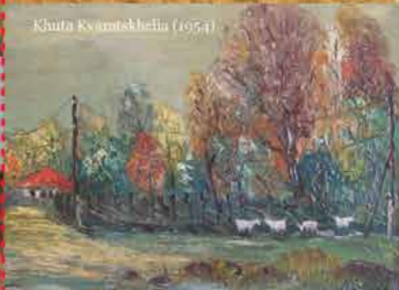
Khuta Kvaratskhelia (1974)