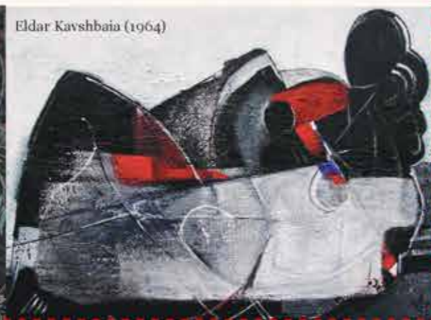
Eldar Kavshbaia (1964)