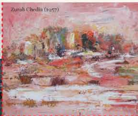
Zurab Chedia (1957)