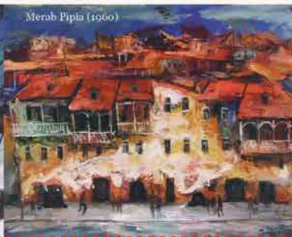
Merab Pipia (1960)