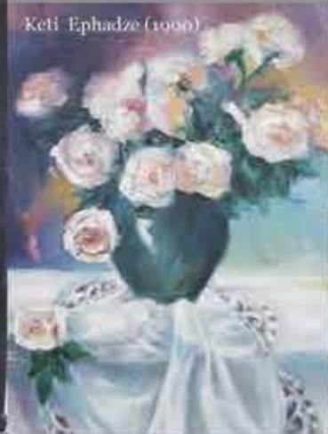
Ketil Ephadze (1990)