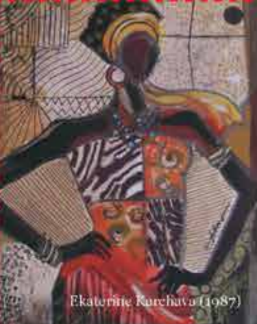
Ekaterine Karchava (1987)