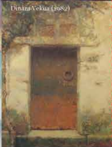
Dinara Vekua (1982)